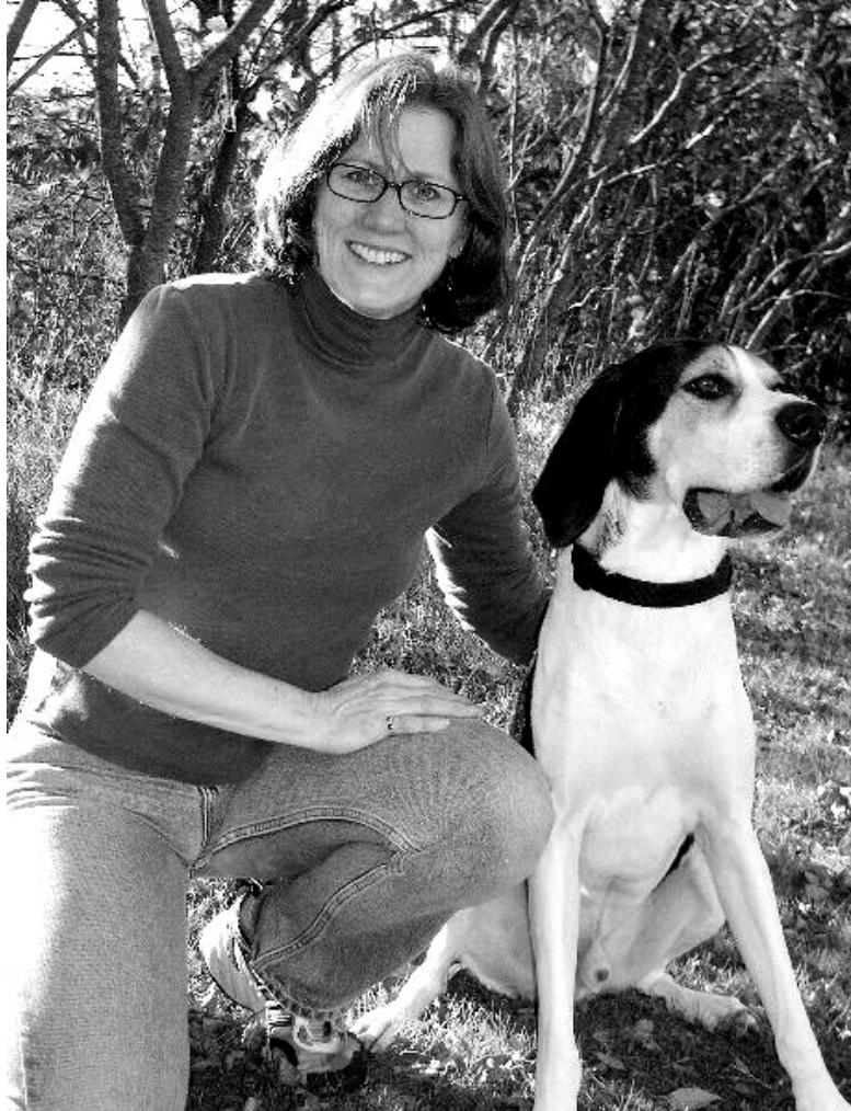
My best friend with her best friend