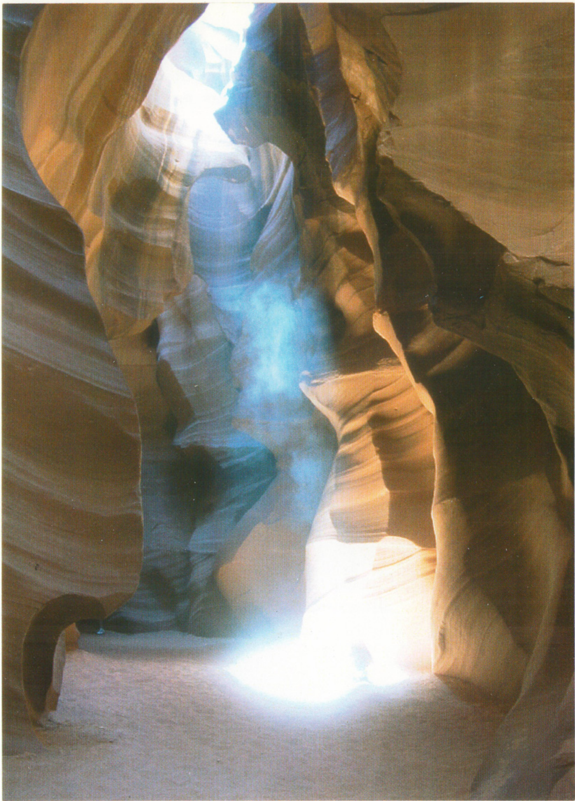
Antelope Canyon, Arizona